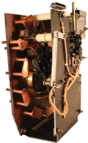
Figure 5. QD8 Quik-Drive tap-changer