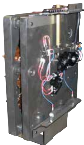
Figure 3. QD3 Quik-Drive tap-changer

The load tap-changer product offering consists of three Quik-Drive™ tap-changers, the most advanced tap-changers in the industry. Each device is sized for a specific range of current and voltage applications and share many similarities in their construction. The primary benefits of Quik-Drive tap-changers are: direct motor drive for simplicity and reliability; high-speed tap selection for quicker serviceability; and proven mechanical life (one million operations). Common Quik-Drive tap-changer features include: neutral light switch; position indicator drive; safety switches; and logic switches (back-off switches). Quik-Drive load tap-changers meet IEEE® and IEC standards for mechanical, electrical and thermal performance.