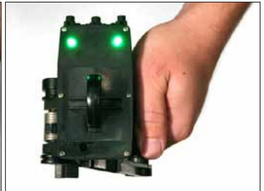
3. Lights will blink to confirm choice