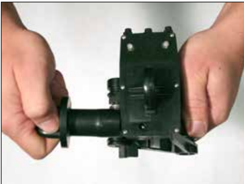
1. Touch SMRT Reset Tool to side of unit